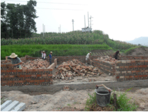
Caption: Building begins for the new clinic in Hui Long village.

Two village health clinics will be built by the Red Cross in rural China using disaster relief and recovery funding from ANZ.