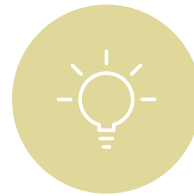
Venture Capital and Growth Private Equity