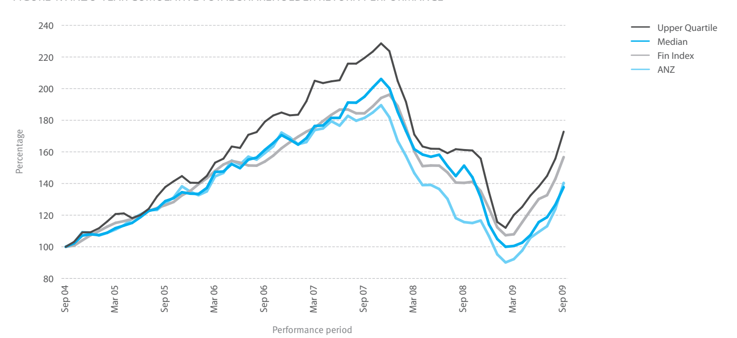
FIGURE 1: ANZ 5-YEAR CUMULATIVE TOTAL SHAREHOLDER RETURN PERFORMANCE

Figure 1 compares ANZ's TSR performance against the median TSR of the LTI comparator group and the S&P/ASX 200 Banks Accumulation Index over the 2005 to 2009 measurement period.