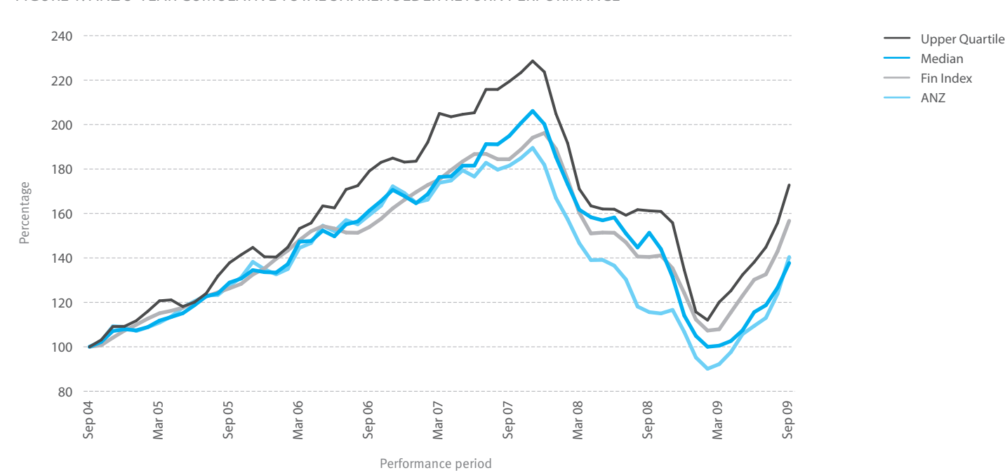
FIGURE 1: ANZ 5-YEAR CUMULATIVE TOTAL SHAREHOLDER RETURN PERFORMANCE