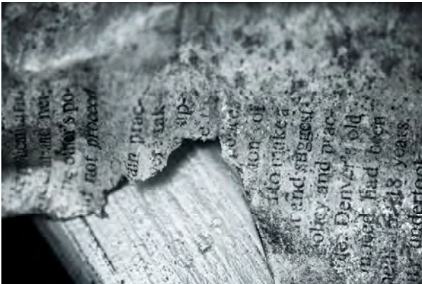
As a paper document, today's guarantees can be easily damaged or lost.

As the recipient of potentially hundreds of guarantees a month, storing and managing these documents is also a pain point for landlords. And as the scale and sophistication of a landlord varies, so too can their processes for storage and management. Significant time and resources are required to efficiently manage these physical guarantees, which potentially need to be managed across multiple landlord entities and locations, and which are also prone to being lost, damaged or stolen.