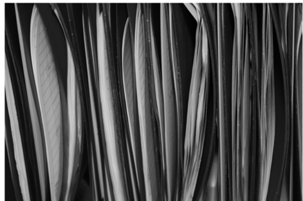
Landlords either store the guarantee with the associated lease, or engage the storage and management services of a third party.

Landlords, at a minimum, store the guarantee with the associated lease agreement on receipt. This is sometimes supplemented by an Excel spreadsheet, or in some instances, the use of a third party to physically store and maintain a register of guarantees. These services are commonly provided by law firms or commercial property managers, and equally, their tracking method could range from something as simple as a spreadsheet, to more bespoke software packages.