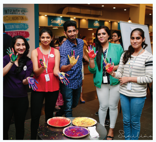
Celebrating diversity through our Stride with Pride Program

We want to achieve a workforce that reflects the diversity of our customers and the communities we operate in. We empower our people to work in an environment that celebrates individuality and uniqueness.