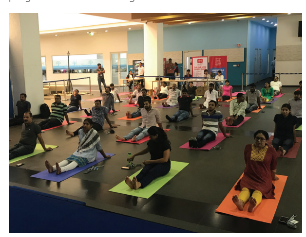
Employee wellbeing initiative - Yoga session in progress

Through passion, care, and technical expertise, we design, implement, and manage a range of wellbeing initiatives and programs across ANZ Bengaluru.