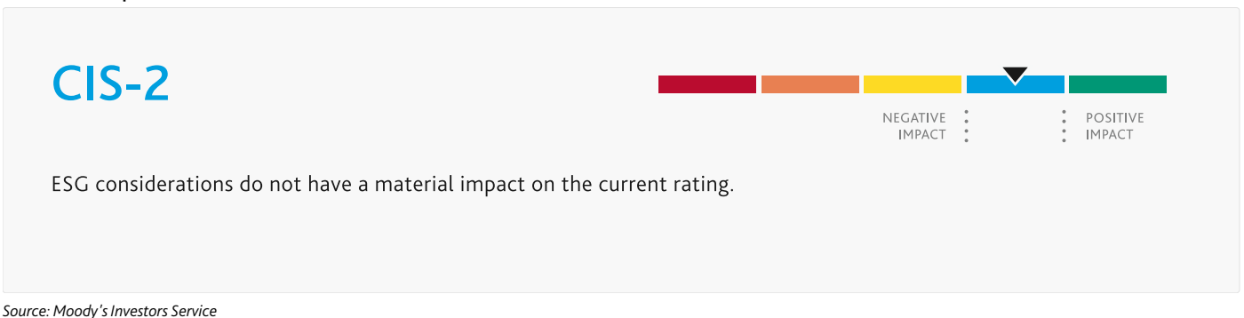
Exhibit 4 ESG credit impact score

ANZ Bank New Zealand Limited's (ANZNZ) CIS-2 indicates the limited credit impact of environmental and social risk factors on the ratings to date, and low governance risks.