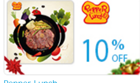
Pepper Lunch Valid date: till 31/12/2015