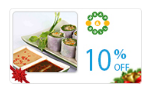
Wrap & Roll Valid date: till 28/02/2016 • Discount 10% on total bill.

• Discount 20% on total bill. Find out more>