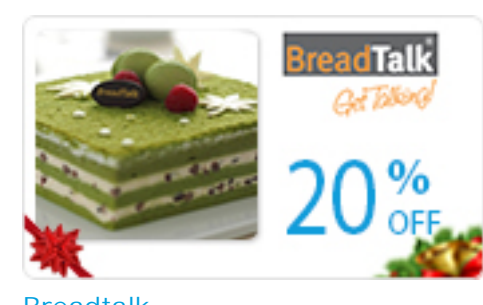
Breadtalk Sat & Sun from 07/11 to 27/12/2015

• Discount 20% on full-price items. Find out more>