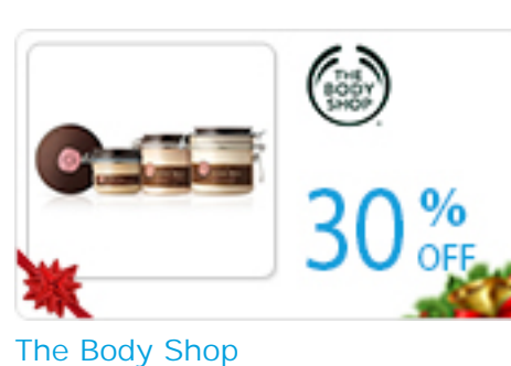
Sat & Sun from 07/11 to 27/12/2015 • Discount 30% on selected items.