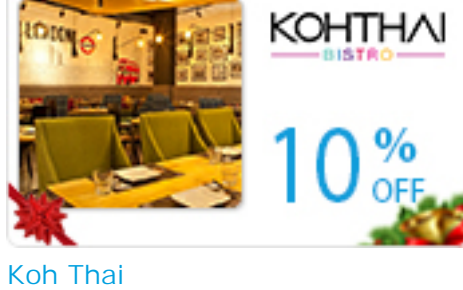
Sat & Sun from 07/11 to 27/12/2015

• Discount 10% on total bill. Find out more>