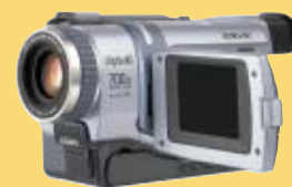
SONY Sony TRV340 Camcorder

ONLY $150 x 3 months INTEREST FREE – SAVE $29